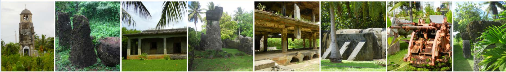
Guam and Commonwealth of the Northern Mariana Islands