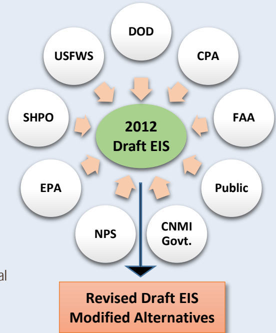
Figure: Stakeholder and Public Input

The Revised Draft EIS presents three modified alternatives, which include a modified Saipan alternative, a modified Tinian alternative, and a hybrid modified alternative. The hybrid modified alternative would combine development on both Saipan and Tinian; however, it would focus most development and operations on Tinian. Both the modified Tinian alternative and the hybrid modified alternative analyze the potential for development on either the south or north side of Tinian International Airport. Details on and comparison of the modified alternatives being considered by the U.S. Air Force are provided on the back of this sheet.